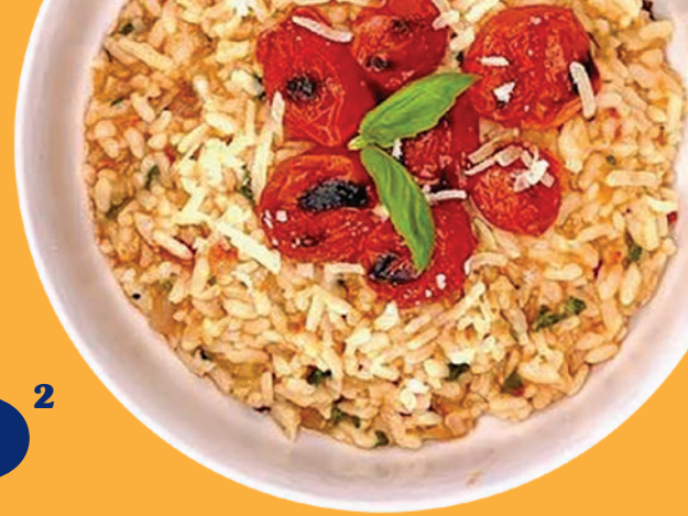
Tomato & Basil Risotto featuring BEN'S ORIGINAL™ READY RICE™ for Risotto

nearly 1/3 of those who try risotto love risotto 2